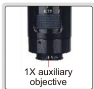
1X auxiliary objective (included)