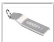
16G USB flash disk (included)