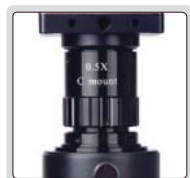
0.5X camera adapter (included)