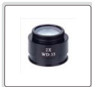
2X auxiliary objective (optional)