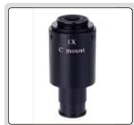
1X camera adapter (optional)