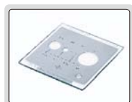
calibration plate (included)